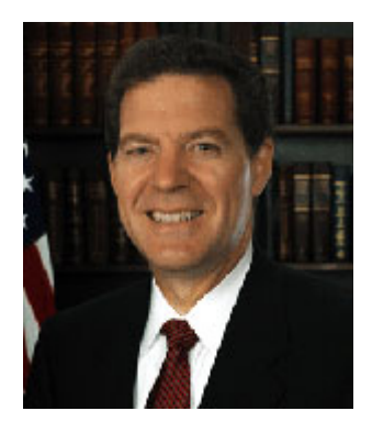
Sam Brownback — Withdrew 19 October 2007

Joe Biden's Official Web Site: <a href="http://www.joebiden.com/">http://www.joebiden.com/</a>